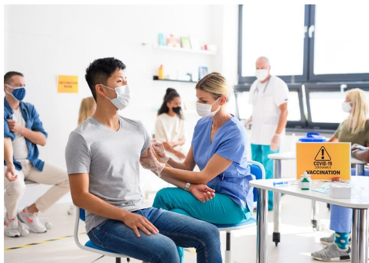
Vaccines provide efficacy against the COVID-19 virus.

On March 5, 2021, Health Canada approved the Ad26.COV2.S by Janssen (JJV), also known as Johnson & Johnson. The vaccine uses adenovirus to deliver spike protein and is administered intramuscularly as a single dose. This is the first vaccine requiring only a single dose that has been approved for use. Phase 3 trials involving close to 40,000 participants demonstrated 66.9% efficacy against moderate to severe COVID-19 2 weeks after the vaccination and 85% efficacy against severe disease 28 days after vaccination. 8, 17