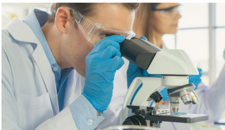
Scientists all over the world are following the development of new strains of the virus.

Based on the current data, it is still too soon to say whether the vaccines will completely eliminate COVID-19 related risks. However, we have witnessed an incredible collaboration in the development of the vaccines. We have seen the high efficacy based on successful phase 3 trials of both m-RNA vaccines, and the continued demonstration of safety. Based on the studies, we may conclude that the m-RNA vaccines are effective for at least 6 months after the second dose against the dominant strain. There is also some promise in the preliminary reports related to protection against current strains. All these factors suggest that a few more months of testing will likely provide us with sufficient information and much-awaited reassurance that will allow the removal or reduction of underwriting restrictions associated with the risk of a severe COVID-19 infection or its consequences.